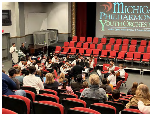
“Tiny Tunes,” May 11, 2024