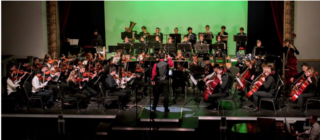
Winter Concert “Side-by-Side” Finale, December 5, 2023

current members, and some members of the Plymouth Community Band put on an exciting concert to mark the end of the MPYO season and the start of summer.